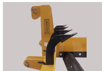
Ripping shanks in storage position