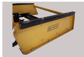
Optional bolt-on weights