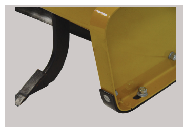
Replaceable skid plate